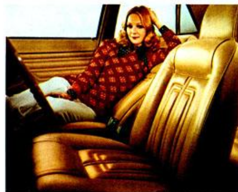
Luxury Decor Option Interior with individual reclining contoured seats trimmed in "super-soft" Tan Vinyl (Code PU).

Note: See Notable Standard Features above. Other items shown are optional.