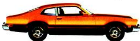
Maverick Grabber—Orange (5W) with Black stripes

Note: See Color Code reference on page 2.