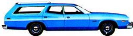
Torino—Medium Blue Metallic (3D)