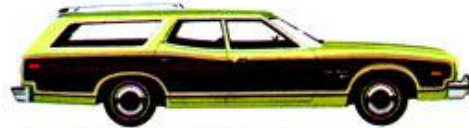
Gran Torino Squire—Green Glow (4T)