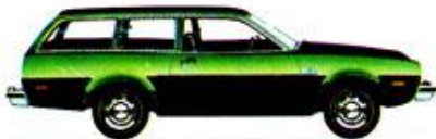
Pinto—Dark Yellow Green Metallic (4V)