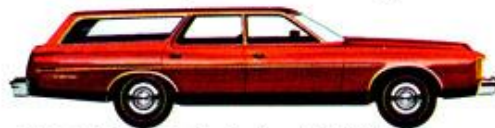
Galaxie 500 Country Sedan—Candyapple Red (2E)

Note: See Color Code reference on page 2.