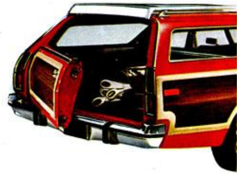
Gran Torino Squire Wagon with 3-Way Magic Doorgate, has wide accessible cargo area.