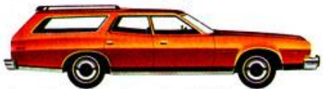
Gran Torino—Medium Copper Metallic (5M)