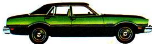
Maverick 4-Door Sedan—Dark Yellow Green Metallic (4V)