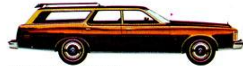
LTD Wagon—Ginger Glow (5J)