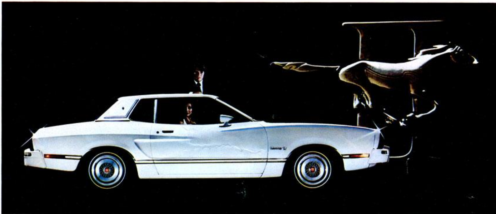
Mustang II Ghia , one of five exciting new models, is shown here in Pearl White (Code 9C). White sidewalls are standard.