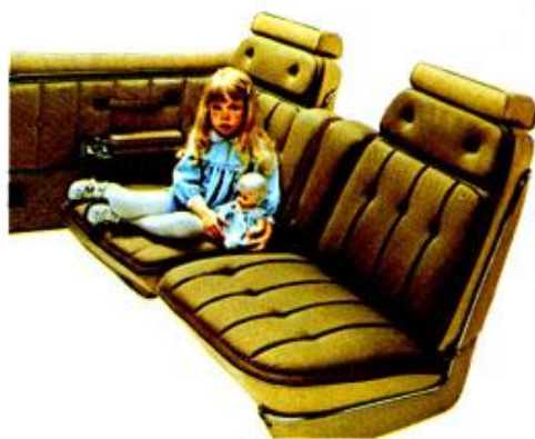
Gran Torino Brougham Interior finished in luxurious, long-wearing Cloth and Vinyl. Shown in Medium Light Gold (Code GY).

Note: See Notable Standard Features above. Other items shown are optional.