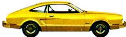
Mustang II 3-Door 2+2—Medium Yellow Gold (6C)