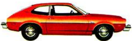
Pinto 3-Door Runabout—Bright Red (2B)

Note: See Color Code reference on page 2.