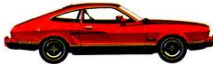
Mustang II Mach 1—Dark Red (2M)