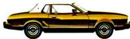
Mustang II Ghia—Ginger Glow (5J)

Note: See Color Code reference on page 2.