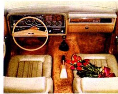
Mustang II Interior trimmed in Tan Vinyl (Code AU). Note the plush cut-pile carpeting, floor-mounted shift and burlwood dash.

Note: See Notable Standard Features above. Other items shown are optional.