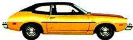
Pinto 2-Door Sedan—Medium Yellow Gold (6C)