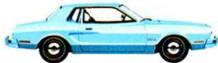
Mustang II Hardtop—Light Blue (3B)