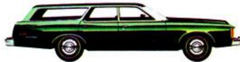
Custom 500 Ranch Wagon—Dark Green Metallic (4Q)