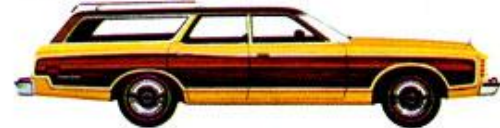
LTD Country Squire—Gold Glow (6F)