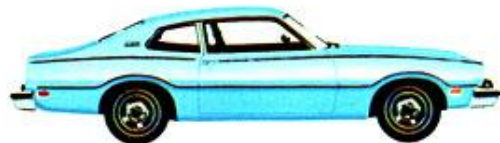
Maverick 2-Door Sedan—Light Blue (3B)