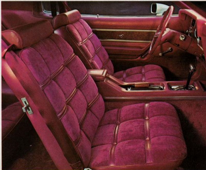
Mustang II MPG Ghia Hardtop with Ghia Luxury Group

Digital Clock (above), an optional, contemporary timepiece, features quartz crystal controlled accuracy.