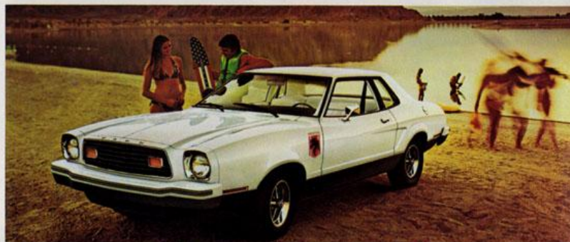
Mustang II MPG Hardtop

Mustang II MPG Stallion Hardtop (below) shows the exciting new look you get with a Polar White exterior (Code 9D) set off with Stallion Group items like: Black grille/bright surround molding, Black moldings/wiper arms, Black-painted lower fenders, lower doors, lower front/rear bumpers, rocker panels and all the other features listed for Stallion 2+2 on page 2. Other Stallion colors available in combination with Blackout areas and items are: Silver Metallic, Vermilion, Bright Yellow (see page 2), and Silver Blue Glow. Trim rings shown are optional.