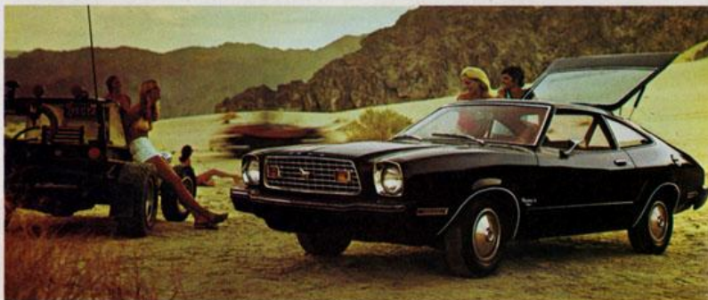
Mustang II MPG 3-Door 2+2 with Stallion Option Group

Mustang II MPG 3-Door 2+2 (below), in Black (Code 1C), features bright moldings throughout, and a bold, bright grille.