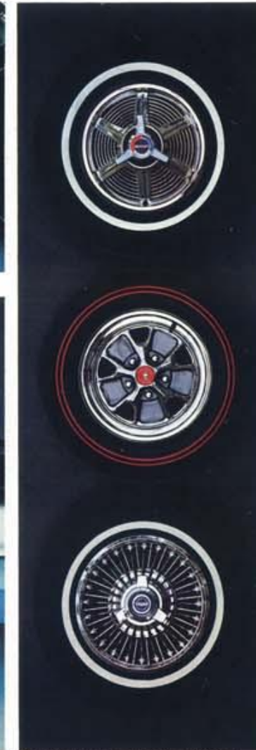
Deluxe Wheels and Wheel Covers