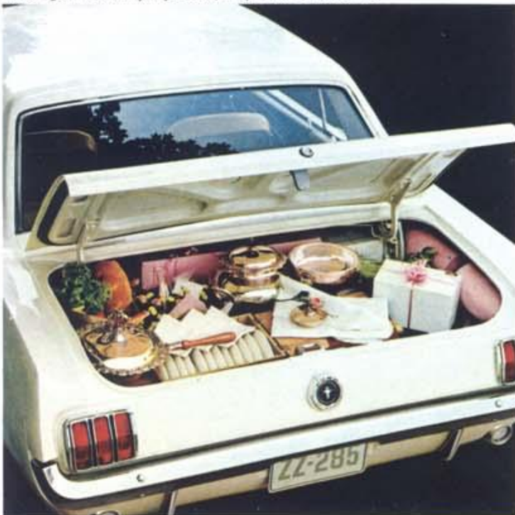
Trunk is surprisingly spacious, easy to load