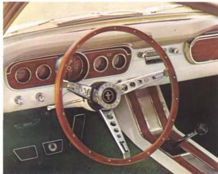
Steering wheel, instrument panel have rich, woodlike finish

*Optional †Available also as separate option