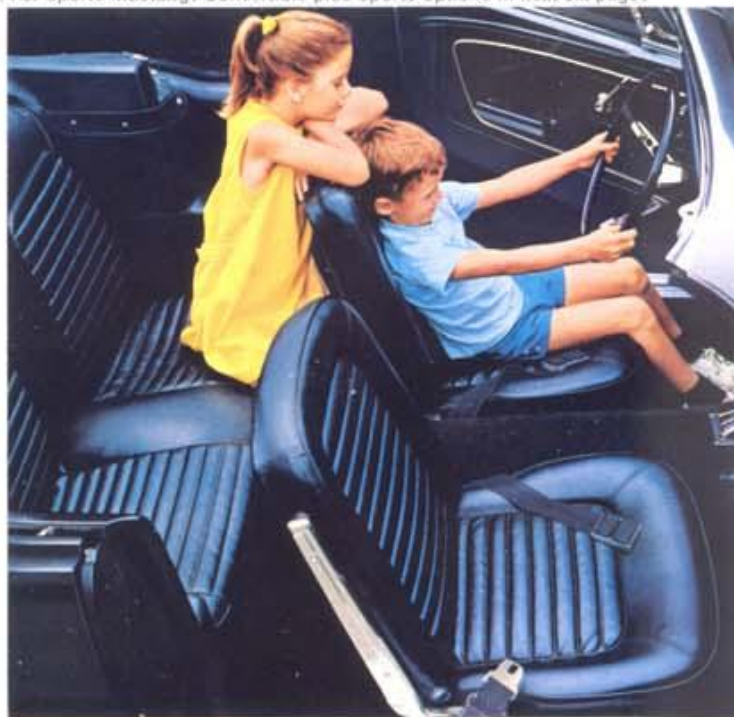
Six all-vinyl trim choices with the look and feel of leather

For sports Mustang: Convertible plus sports options in next six pages