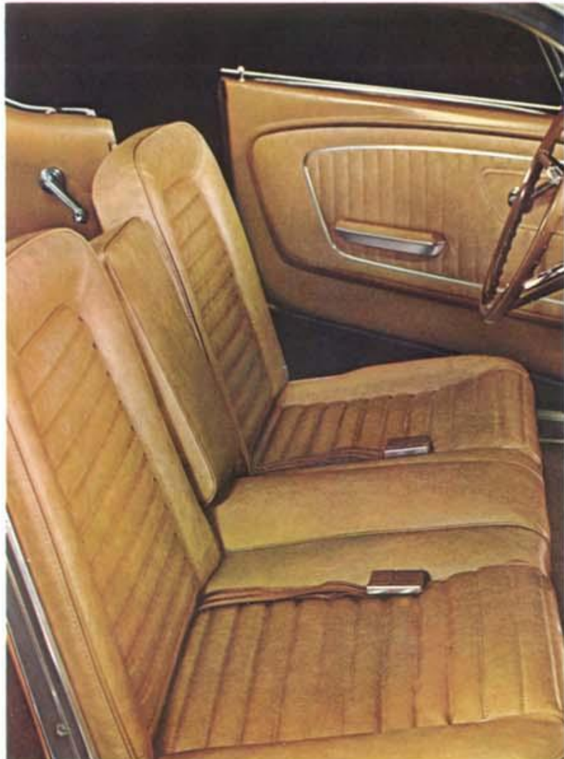
Full-Width Seat (Hardtop, Convertible)

†Replaces side air scoop ornament; rocker panel moldings standard on Fastback