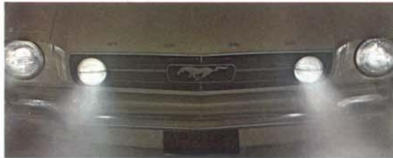
4-Inch Fog Lamps

†Separate option, not included in GT Group