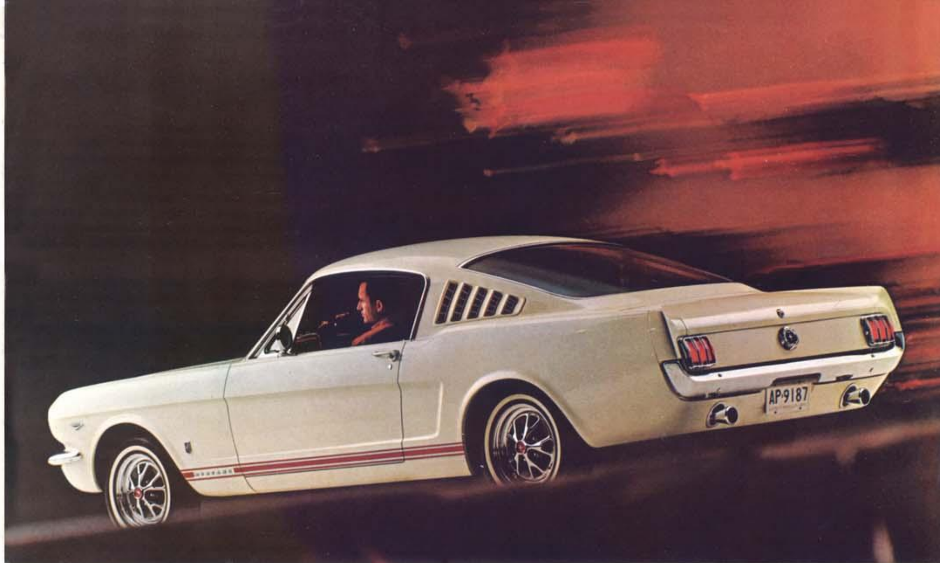
271-hp Challenger High Performance V-8†