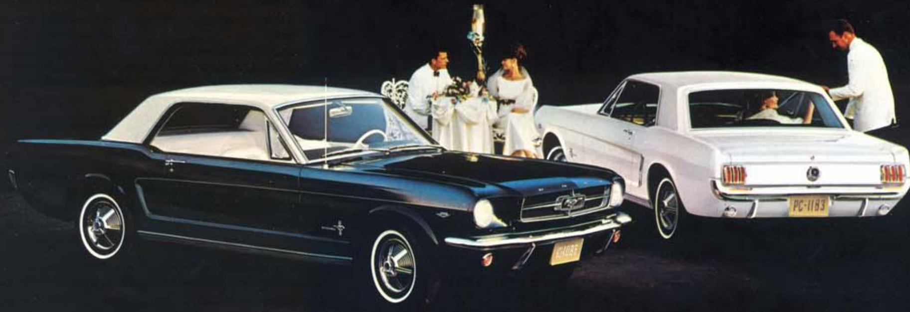
Mustang options make a luxurious personal car (right) of Mustang Hardtop (far right)