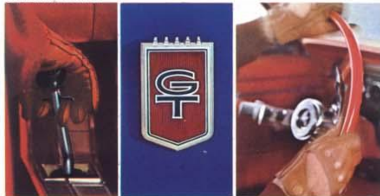
4-Speed Stick Shift†