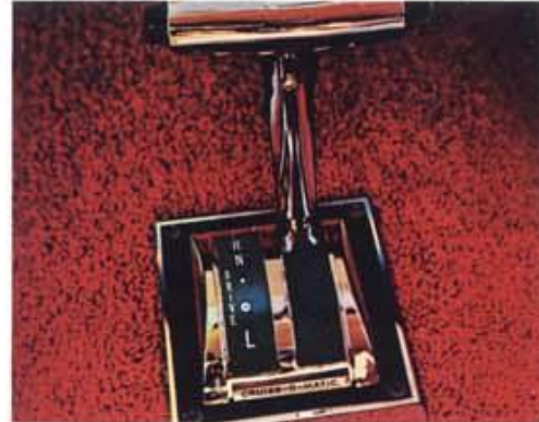
T-bar Cruise-O-Matic Drive