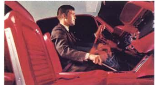
2+2 cockpit: where spirited looks come alive!

< Fastback 2+2: imported looks at a low Ford price