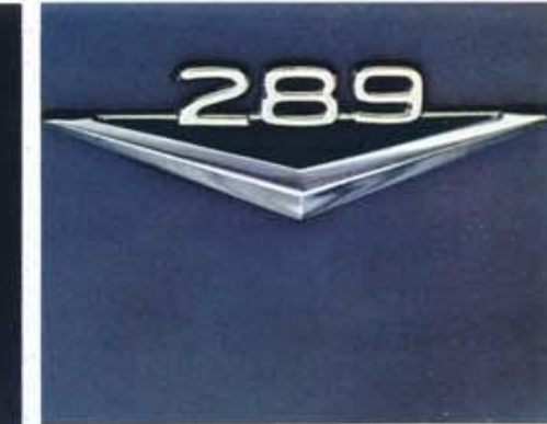
Three sports-blooded V-8's