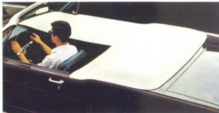
Tonneau cover adds true sports-car flair