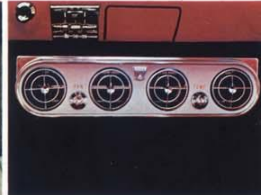
Ford Air Conditioner