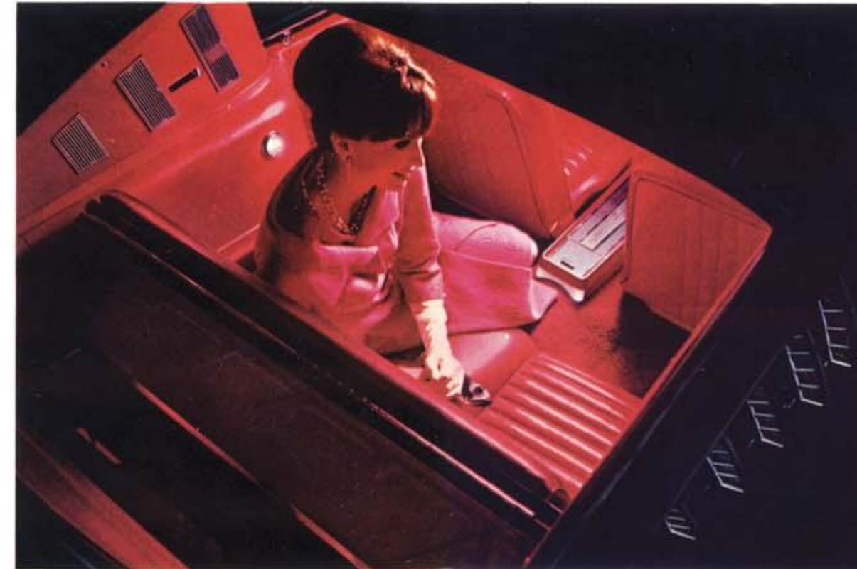
Rear seat luxury in the 2+2