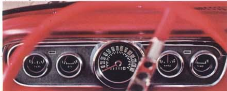
GT Instrument Cluster