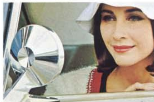
Remote-Control Outside Mirror