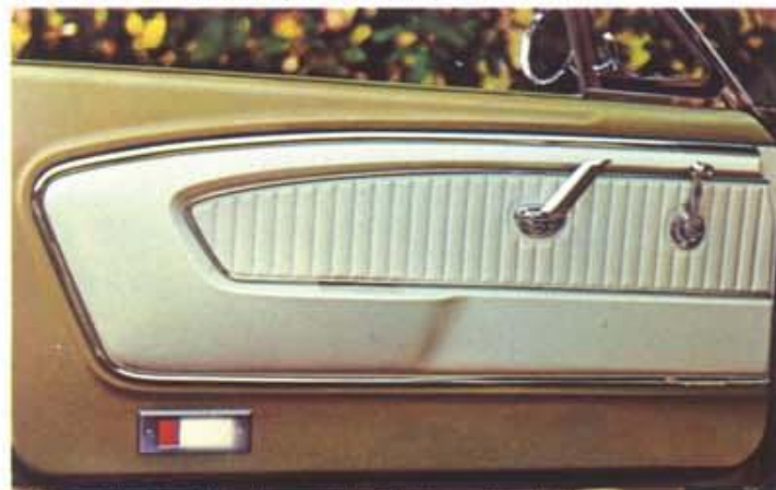
Door panels have integral arm rests, safety-courtesy lights