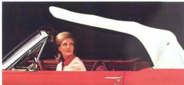
Power top is one of over 70 options