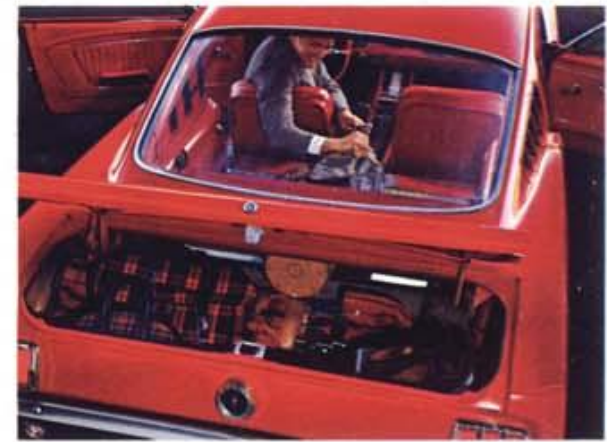
Folding rear seat triples luggage space