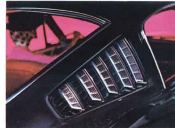
2+2's Silent-Flo Ventilation louvers

A new standard 120-hp, 200-cu. in. Six is quick and strong . . . a quality thoroughbred, smooth as a jewel with its 7-main-bearing crankshaft. Thrifty, too, the Six is just one of many "savers" standard in Mustangs. Twice-a-Year Maintenance . . . self-adjusting brakes, aluminized muffler . . . plus all the other service savings pioneered by Ford. Any wonder that Mustangs are so easy to fall in love with?