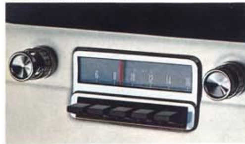
Push-Button AM Radio