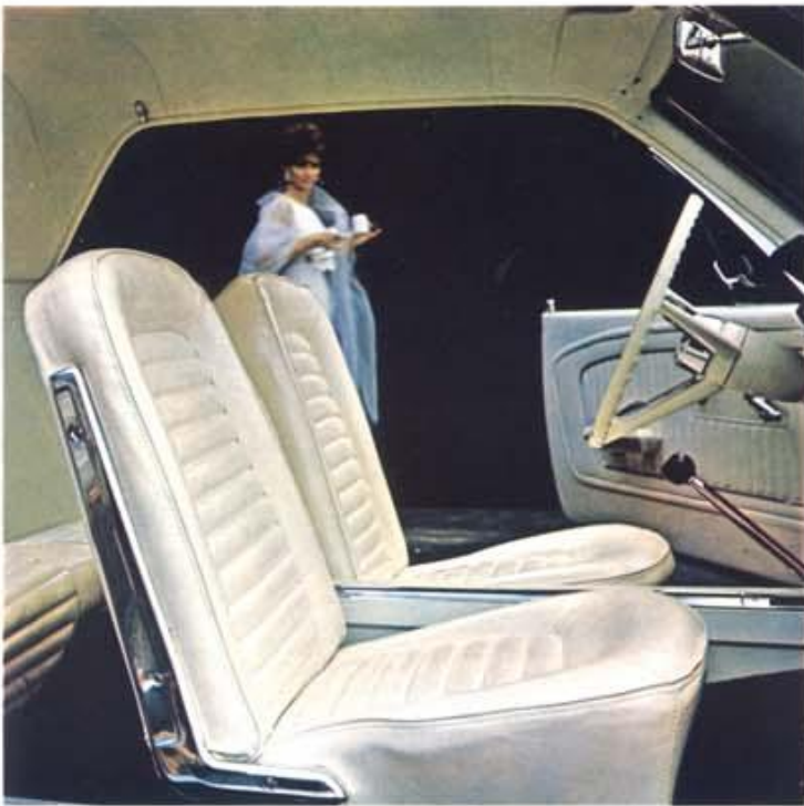
Mustang's individually adjustable, deep-foam bucket seats