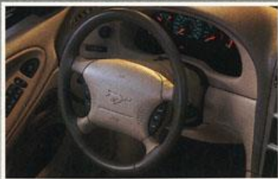
Leather-Wrapped Steering Wheel