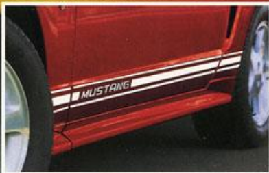
Rocker Panel Stripe