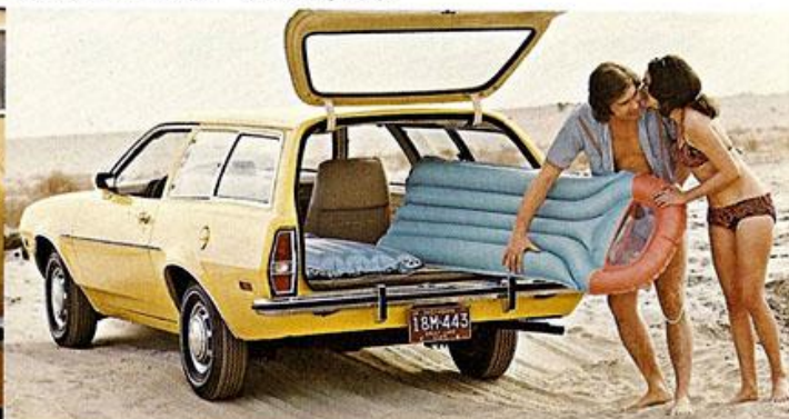
Like all Ford wagons, it packs a lot more cargo, comfort and wagon value.

10 cu. ft. more loadspace than Vega and VW, 5 cu. ft. more than Toyota. More room for fun and friends, the kind of convenience and usefulness you'd expect from a Ford wagon.