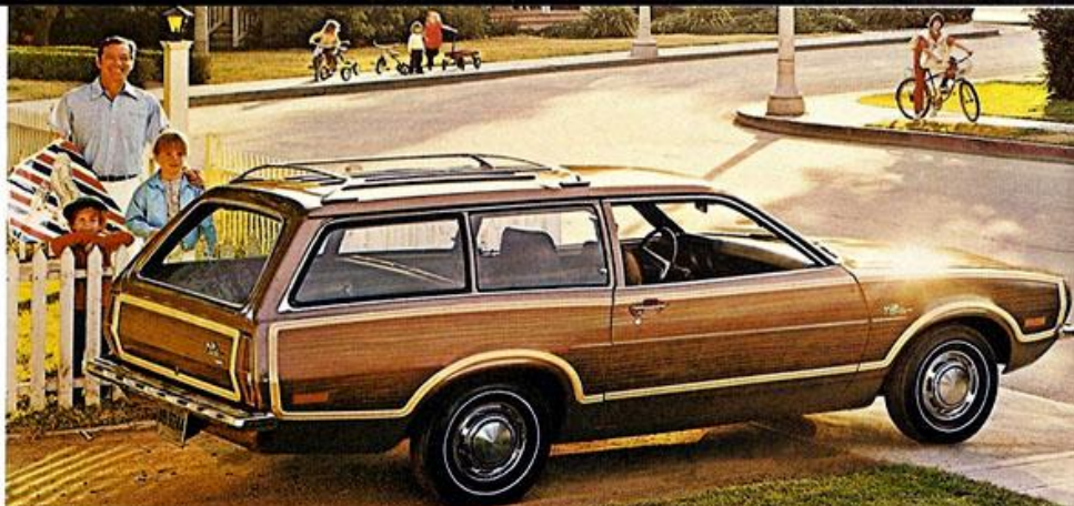
Pinto Squire option. Big wagon luxury with a little Pinto price. No other subcompact wagon offers this kind of elegance. Hand-some woodtone touches and bright accents, inside and out.

NOTE: Base Pinto Wagon illustrated above and lower right with optional Accent Group, bumper guards, and whitewalls. Squire Option shown above (right) with optional luggage rack, bodyside molding and whitewalls.