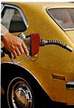
Like all Pintos, it costs less to buy and operate. You pay less to begin with, and Pinto Wagon keeps on costing less with good mileage, 6000-mile recommended service intervals (versus 1000-mile checkups on some imports), many do-it-yourself features.

Deluxe upholstery and door trim panels, deluxe lap/shoulder belts, courtesy lighting, Ford's exclusive "Squire" look, Pinto's famous frugal ways.