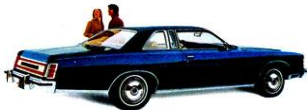
LTD Brougham 2-Door Pillared Hardtop. Note the distinctive-looking new center pillar window. Shown above in Dark Blue Metallic (Code 3G).