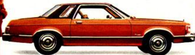
Granada Ghia 2-Door , featuring opera windows, vinyl roof, WSW steel-belted radials, and other fine luxury touches. Remarkably roomy interior and wide door for easy entry. Finished in Tan Glow (Code 5U).