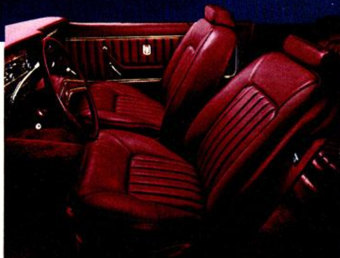
Inside Ford Granada , individual reclining contoured seats that adjust to over 100 positions, soft vinyl seat trim, deep-pleated door panels, thick nylon carpeting, burled walnut woodtone accents. European-type armrests, and more. Red Vinyl shown (Code AD).