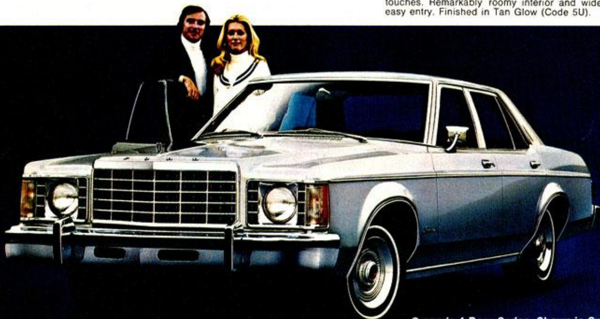
Granada 4-Door Sedan . Shown in Sparkling Silver Metallic (Code 1G). High roofline has classic look, provides excellent headroom, front and rear.

When people need a new kind of car, there's a new kind of Ford. Meet the new Ford Granada, designed for the way driving is today. The size is new. Trim. Personal. Interior room and luggage space is comparable to larger cars, although Granada is about 2 feet shorter (and half a ton lighter) than most standard-size cars. There's seating comfort for five—with individual reclining seats. The look, the lines, the luxury are reminiscent of the Mercedes 280. But Granada is built to act like an economy car. It has gas-saving, steel-belted radial ply tires, solid state ignition, is scheduled to go 5,000 miles between oil changes, 30,000 miles between chassis lubes.