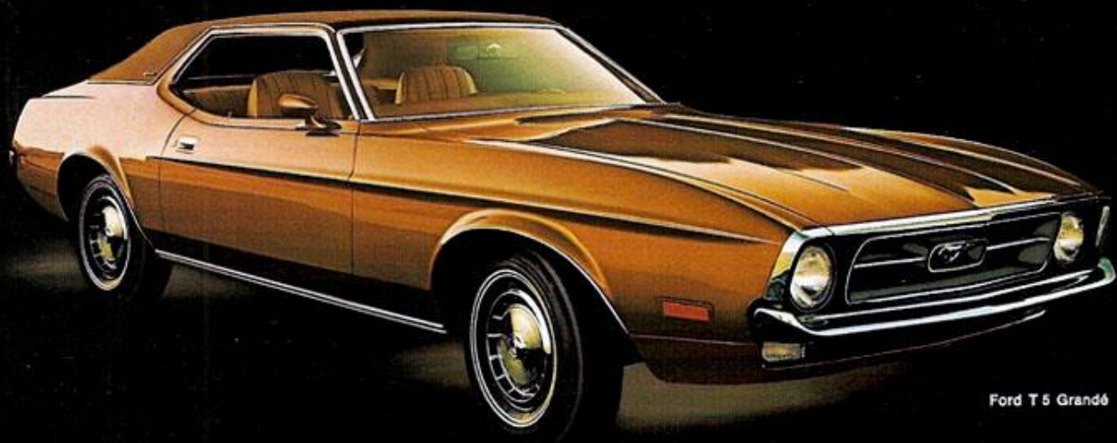
Ford T5 Grandé