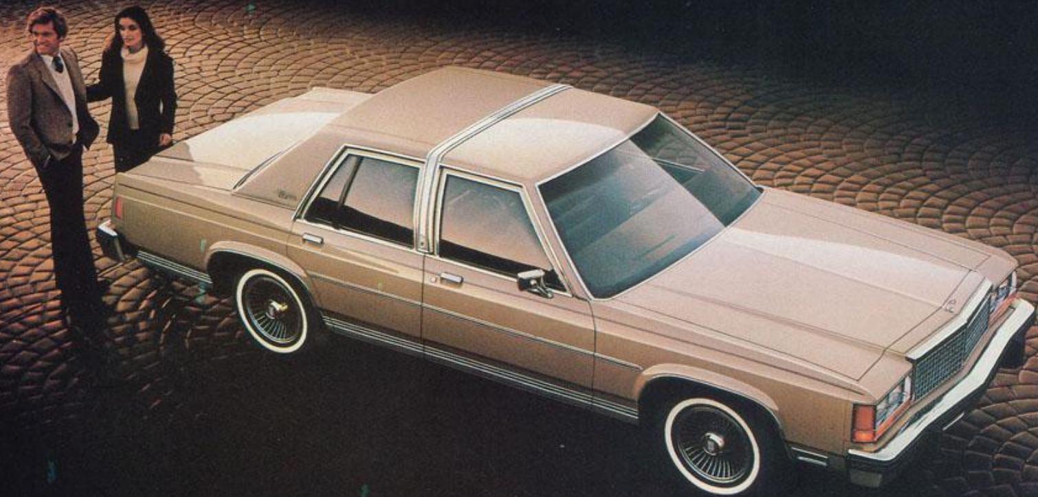
LTD Crown Victoria in Fawn (89) with matching padded rear half vinyl roof