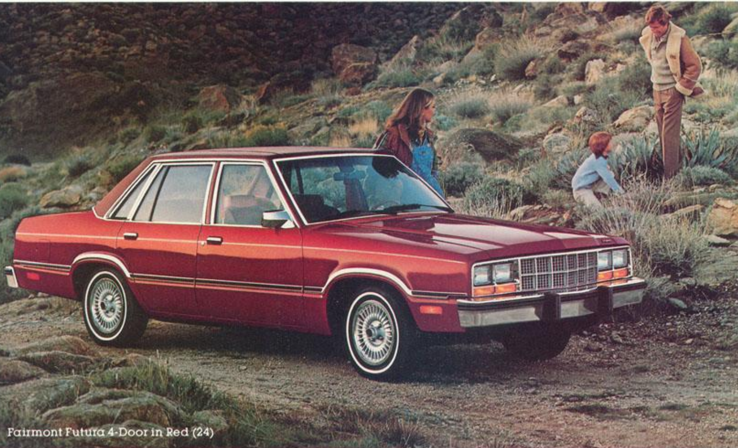
Fairmont Futura 4-Door in Red (24)