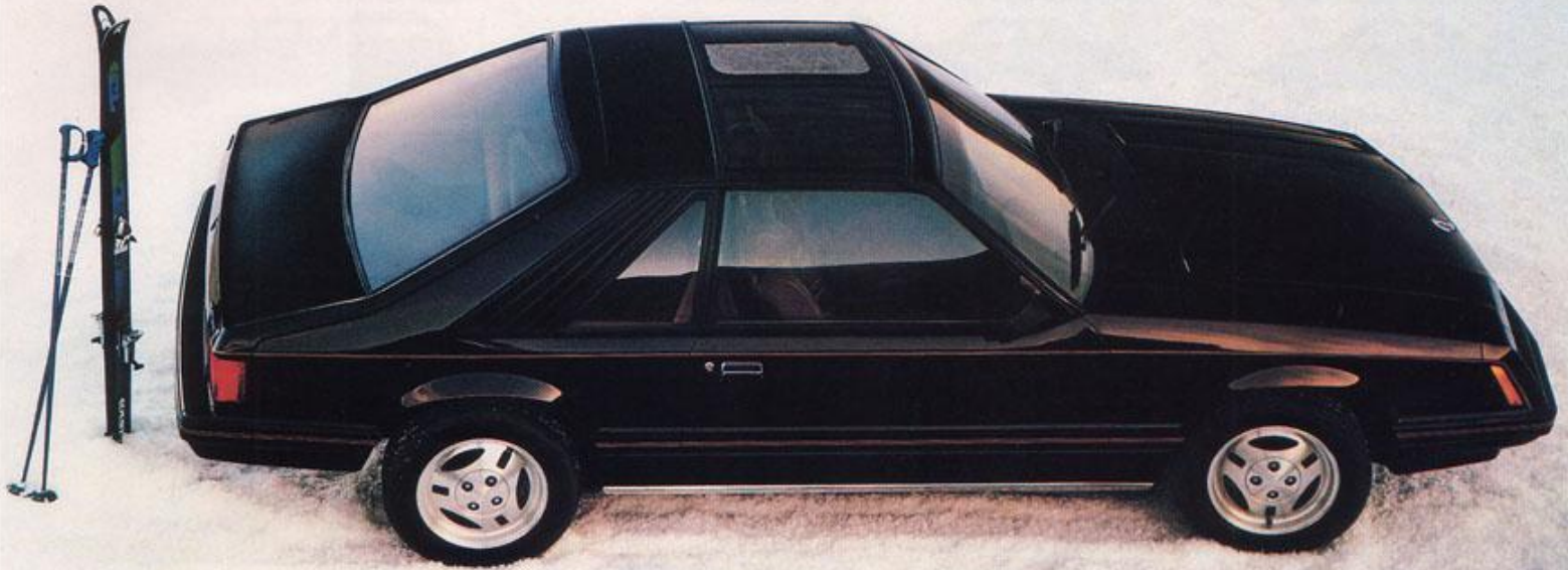
Mustang Ghia in Black (1C) with new T-Roof option.