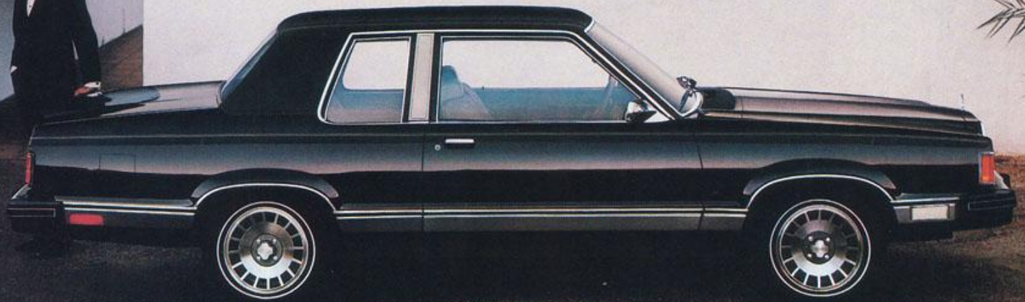
Granada GL 2-Door in Black (IC)