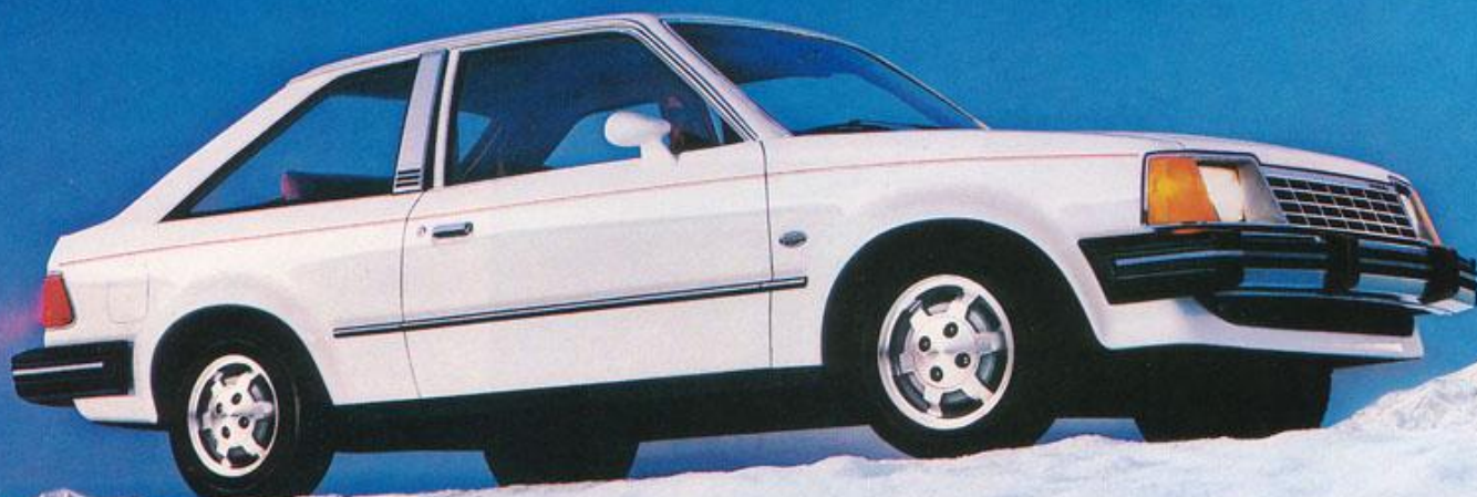
Escort GLX 3-Door Hatchback in Polar White (9D)