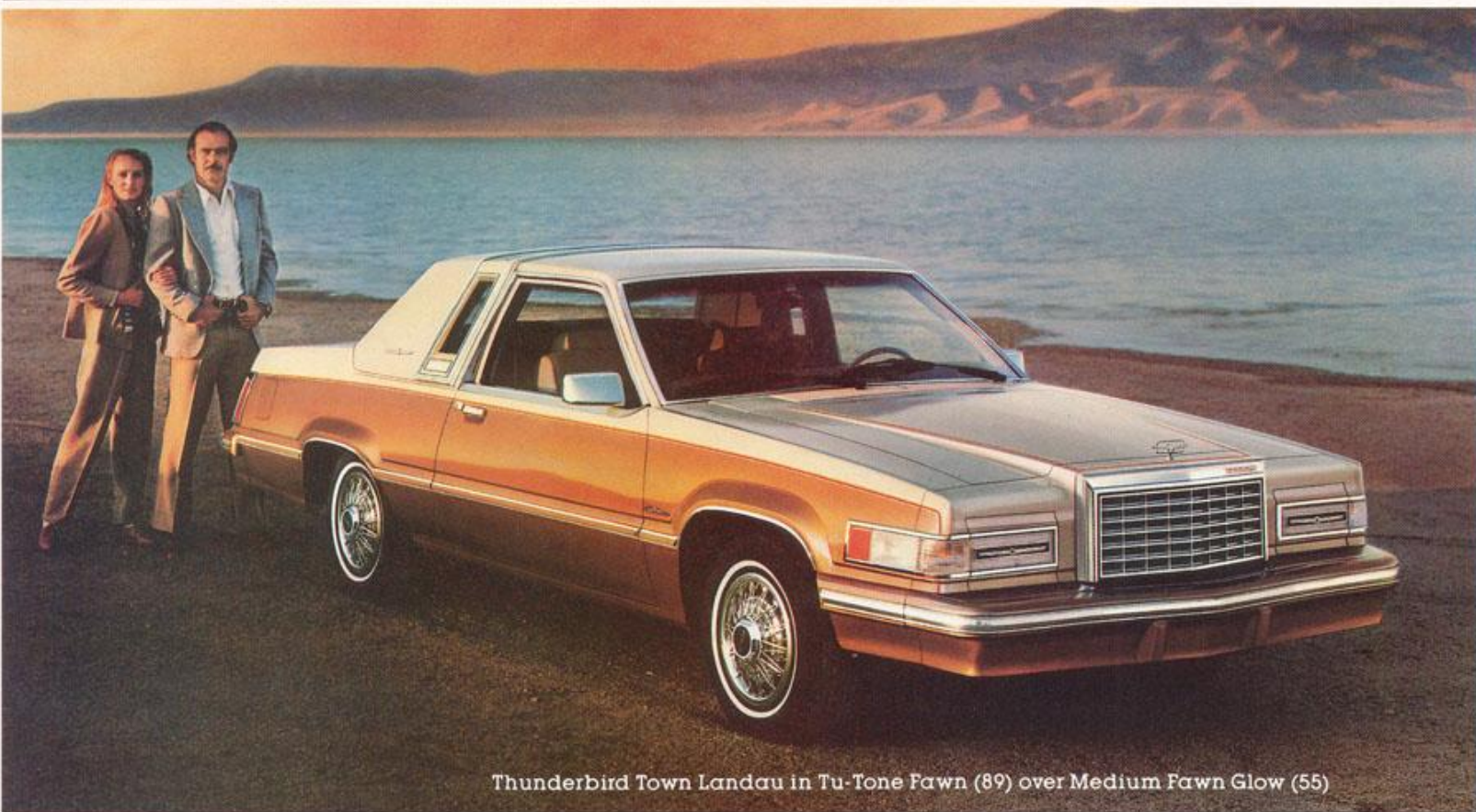
Thunderbird Town Landau in Tu-Tone Fawn (89) over Medium Fawn Glow (55)