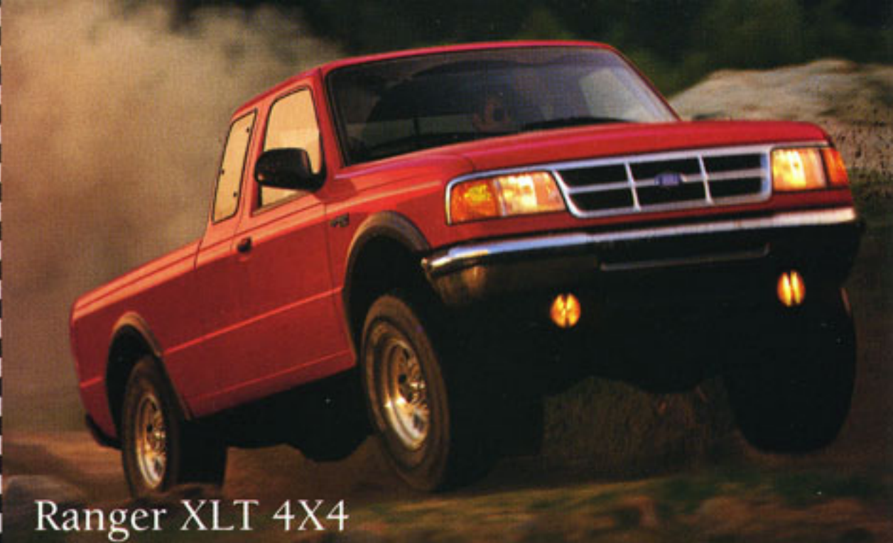
Ranger XLT 4X4