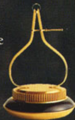
1994 Motor Trend Car of the Year.

And in keeping with our "we race, you win" tradition, it only made sense that our latest