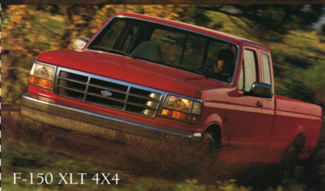
F-150 XLT 4X4