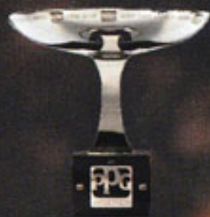
1993 PPG IndyCar World Series Champion