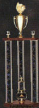
1993 Off-Road Truck Manufacturer's Champion

You have to be good to bring race technology to the street. You have to be even better to bring race-winning technology to the street.