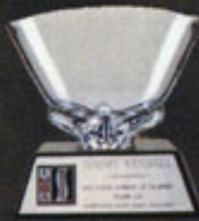
1993 IMSA GTS Driver's Champion