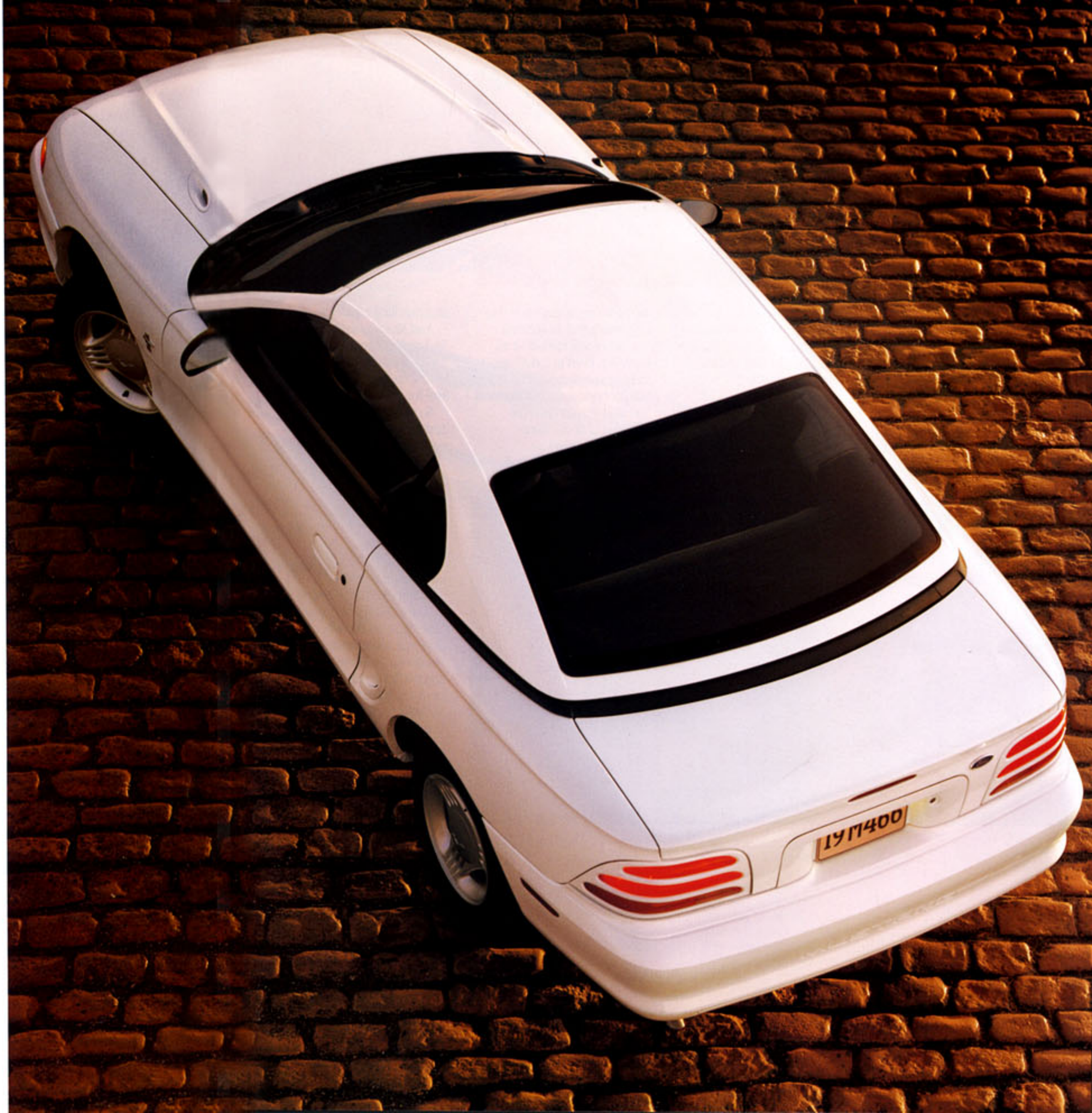
At right: Mustang convertible in Crystal White. It's shown with the optional factory-ordered removable hardtop (see your dealer for availability), which is easy to put on and take off and comes with a rolling stand and storage cover. Some other equipment shown is also optional.

With Mustang for 1994, you can have your hardtop coupe — and your convertible, too.