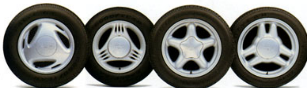
Left to right: 15" wheel covers (standard on Mustang); 15" cast aluminum wheels (optional on Mustang); 16" cast aluminum wheels (standard on Mustang GT); 17" cast aluminum wheels (optional on Mustang GT).

*Must be factory-ordered. See your dealer for date of availability and selection of colours. **Requires electronic AM/FM stereo/cassette premium sound system or the Mach 460 sound system.