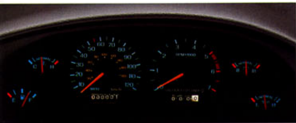
Mustang comes equipped with analogue gauges: engine temperature, battery charge, fuel level and oil pressure. Plus a tachometer to read the pulse of the standard 3.8-litre V-6.

While Mustang is all-new in style and design, you may likely find technical sophistication to be one of its most impressive