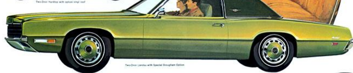
Two-Door Landau with Special Brougham Option