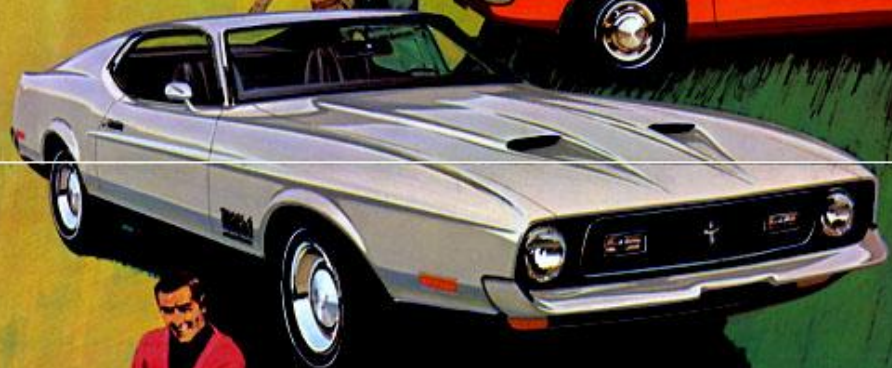
Mustang Mach 1