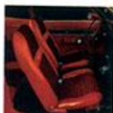
Maverick Grabber standard interior

See the three new Mavericks at your Ford Dealer's. Discover why so many people have become such happy mavericks with America's one true compact car.