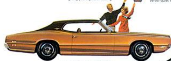
Two-Door Hardtop with optional vinyl roof