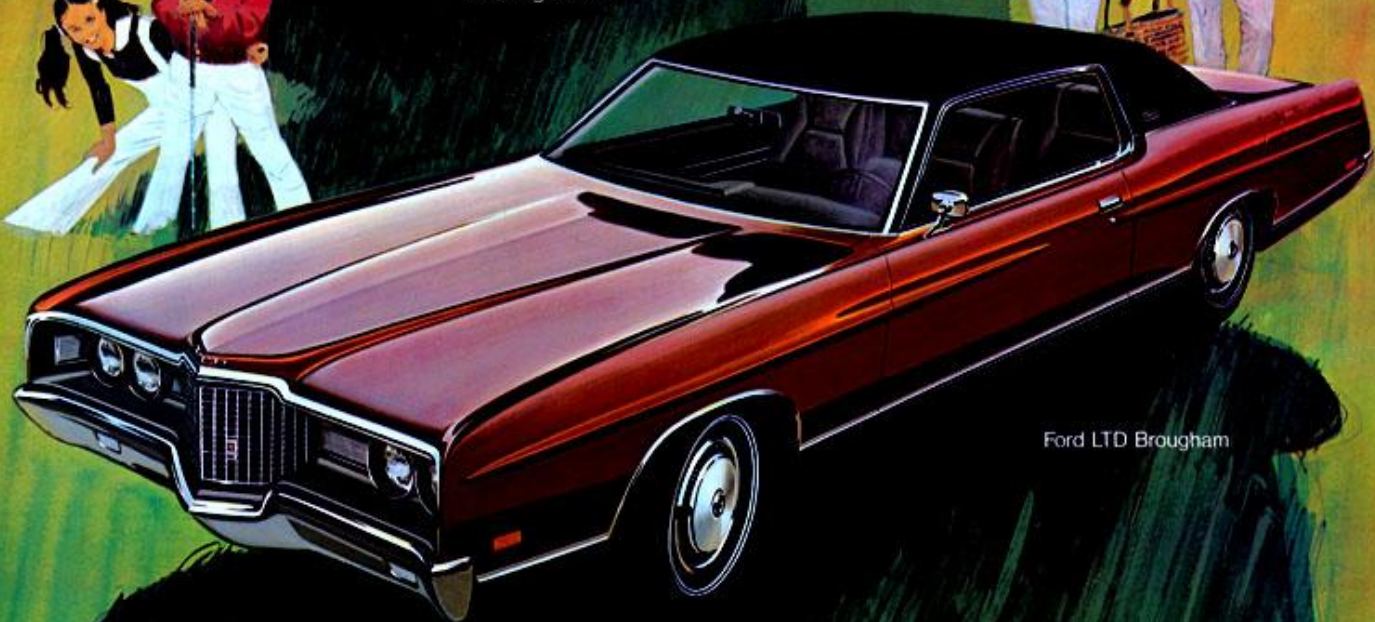
Ford LTD Brougham