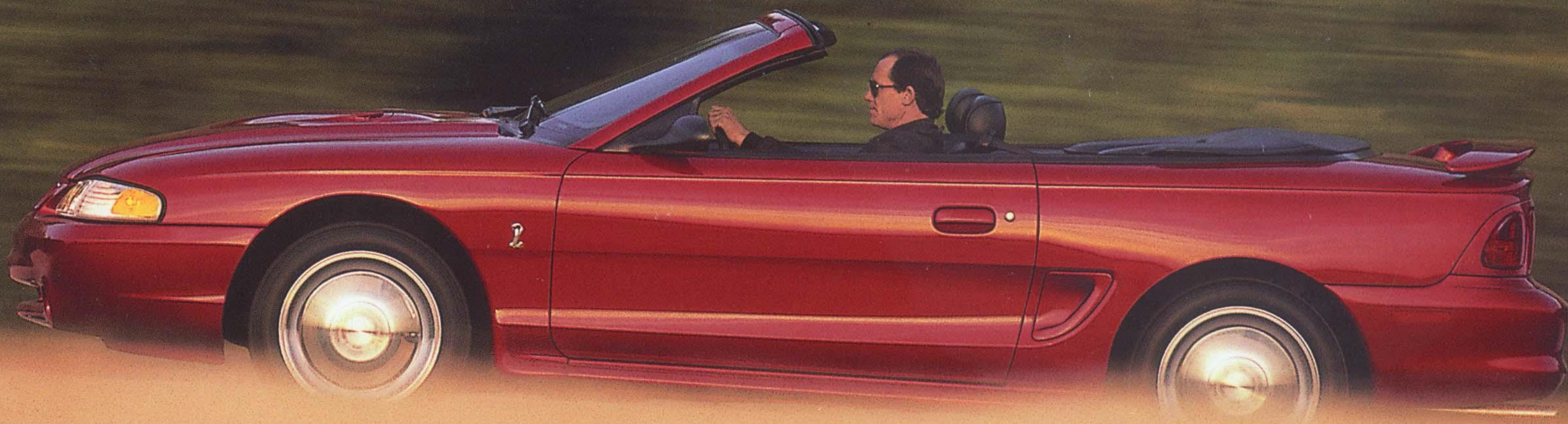
The 1996 Mustang Cobra has a powerful and refined DOHC V8 that produces 305 horsepower.

Cobra convertible available March, 1996.