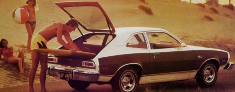
Pinto 3-Door Runabout with Squire Option

priced so you can enjoy it now. Ford has brought a fine road car into the mid-size field. Along with its superb roadability, the Elite gives you a full measure of luxury at a reasonable price. You see elegant Elite touches everywhere—all or half vinyl roof standard at no extra charge. Twin opera windows, distinctive exterior brightwork, generous soundproofing, and interior appointments that distinguish Elite as a personal car. Besides all its standard features, the Elite is available with a wide variety of options, including a power Moonroof. While the Elite keeps cools-down with its many maintenance-reducing features—it lifts your spirits up every time you take to the road. Elite—spirited proof that Ford means value. Elite 2-Door Hardtop (left) has a look of its own with its distinctive grille, twin opera windows and vinyl roof. Dark Jade Metallic (Code 46) with Jade vinyl roof. Interior Decor Group (right) is a personal luxury option that includes individually adjustable split bench seats with dual armrests, automatic seat back release, your choice of soft cashmere-like cloth or soft all-vinyl trim, shag carpeting, vinyl vanity mirror, color-keyed deluxe belts, dual note horn, and even a special speed instrument panel with tachometer. Shown in super-soft vinyl, White with Jade trim (Code D2). Bucket seats also available. For more details and illustrations, see your Ford Dealer for a 1976 Elite Catalog.