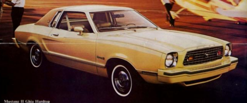
Mustang II Ghia Hardtop