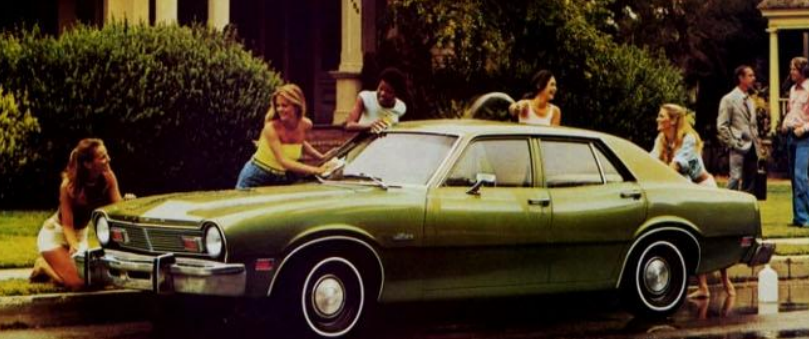
Maverick 4-Door Sedan