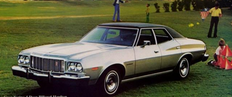
Gran Torino 4-Door Pillared Hardtop