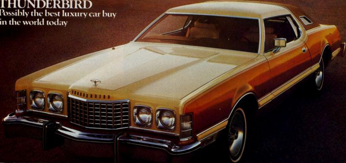
Thunderbird with Creme and Gold Luxury Group

Possibly the best luxury car buy in the world today