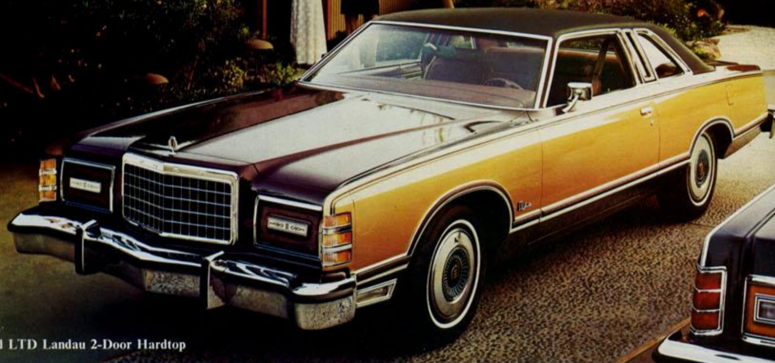
Ford LTD Landau 2-Door Hardtop