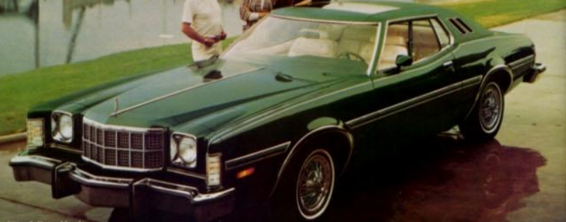
Elite 2-Door Hardtop