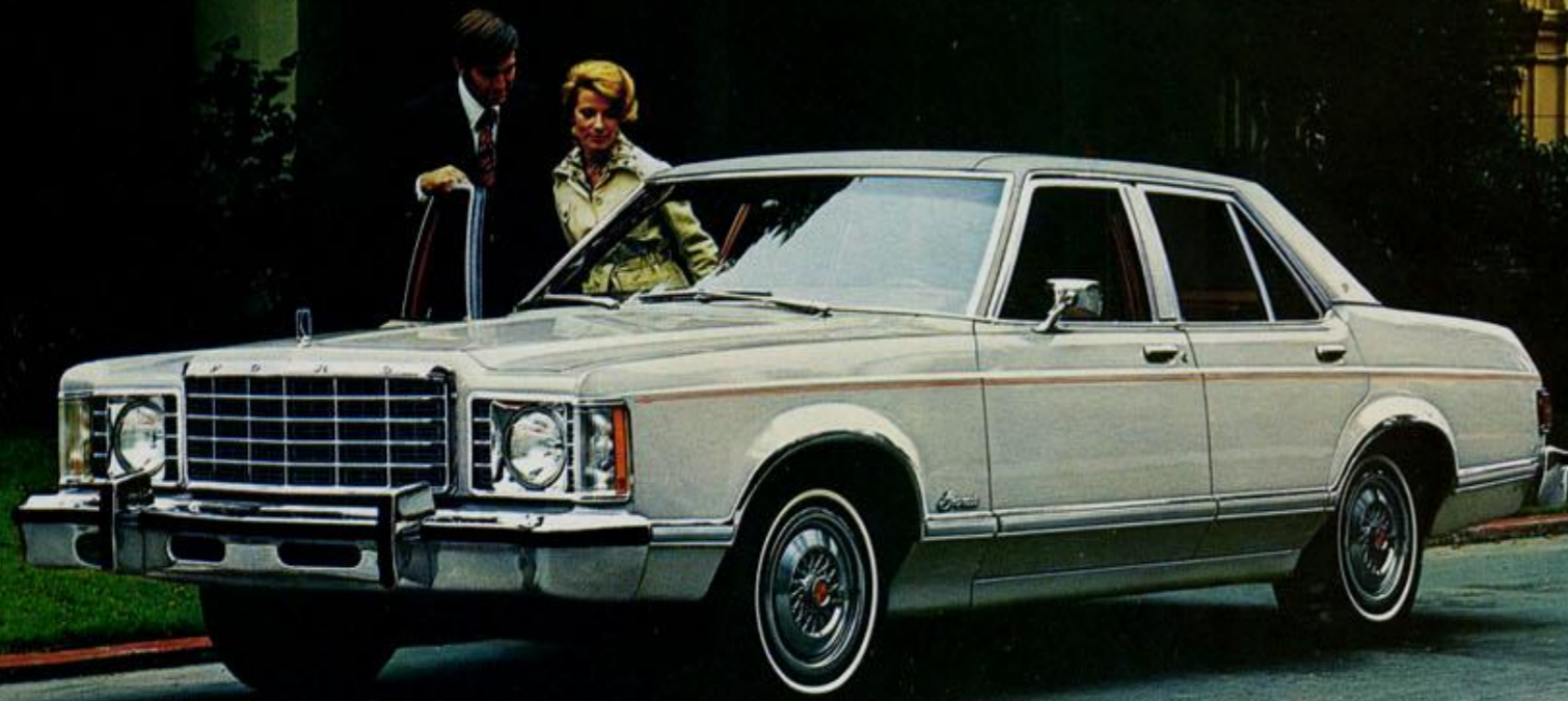
Granada Ghia 4-Door Sedan